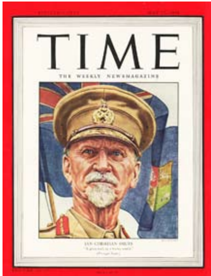
Jan Smuts on the cover of Time .

race relations—the British themselves introduced the pass system in the 19th century—and the wartime government of Jan Smuts laid some of the founda-